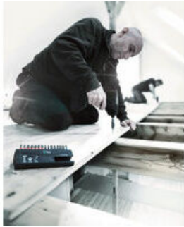
Impaktor holder with ring magnet

Impaktor technology for an above-average service life even under extreme demands